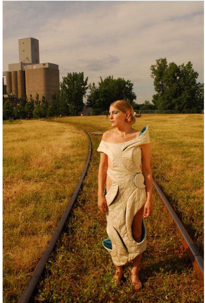
Fig 7 The "Luttergill" dress

shape memory alloy (SMA) stitched into the inside of the fissures. The SMA is controlled through our custom electronics board. LUTTERGILL twists and narrows around the waist, morphing into a belt that encircles the body and is fastened in the front with a bespoke leather clasp. LUTTERGILL is accessorized with a beautiful asymmetric skullcap that shields half of the face and curls around to accentuate the exposed eye.