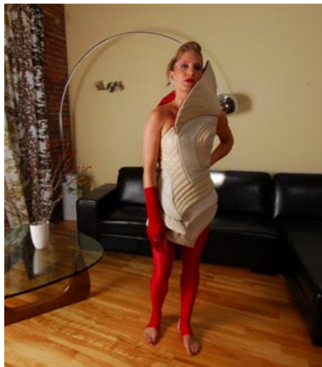
Fig 4 The “Skwrath” dress

SKWRATH is a quilted leather bodice, constructed out of stony leather lined with blood red silk. It integrates a sculptural wing-like collar around the head that can be used to conceal the face of the host and can be torn open to reveal the scarlet lining. The abdomen is made up of three interlocking leather segments or plates, embroidered with threads of shape memory alloy (SMA), which are activated through a custom electronic board to contract and curl back to reveal deep slashes of red silk.