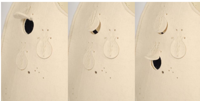
Fig 2 The animation of the “Enleon” dress

ENELEON is constructed out of heavy hand-made felt, creamy leather, and reflective lamé lining. It is shaped like a large bilateral symmetric pod that encloses the body from front and back. The materials are perforated with small decorative holes that allow some airflow around the body. Each side features six scattered scales that rise and lower in order to reveal a mirrored lining. The movement is activated by beaded shape memory alloy (SMA) coils, controlled through custom electronics. A sculpted felt mask obscures the face with reflective chain mail, further erasing the host’s identity. The front and the back are identical, so the host assumes an element of radial as well as bilateral symmetry.