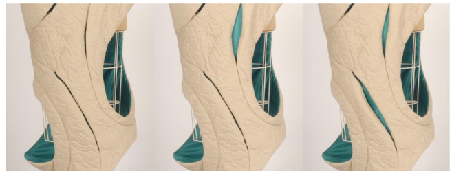
Fig 8 The animation of the "Luttergill" dress

Acknowledgements Skorpions is funded by The Canada Council for the Arts, the Hexagram Institute for Research/Creation in Media Arts and Technologies, and the Social Sciences and Humanities Research Council of Canada.