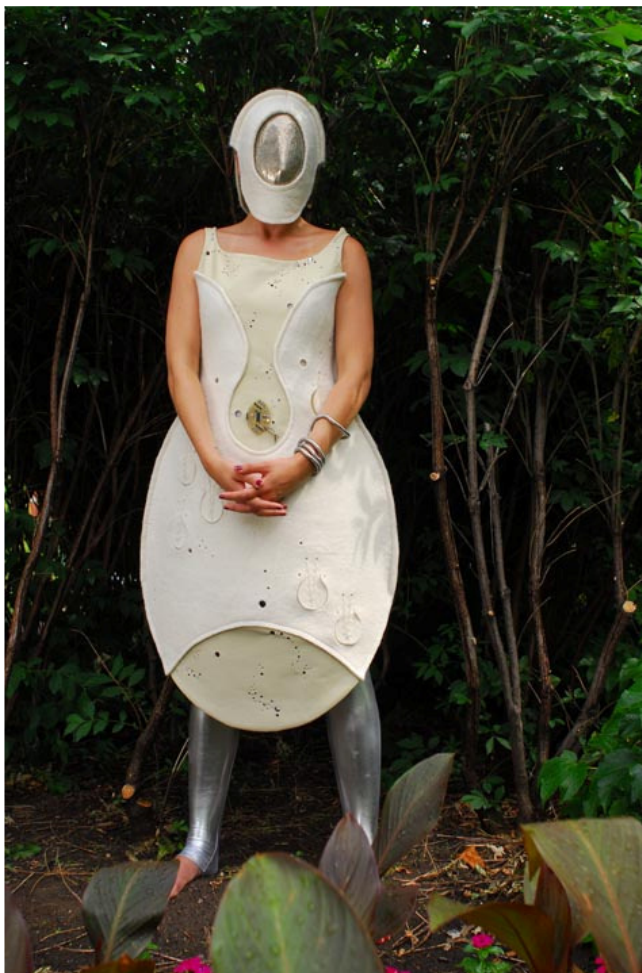
Fig 1 The “Enleon” dress

Skorpions reference the history of garments as instruments of pain and desire. They hurt you and distort your body the same way as corsets and foot binding. They emphasize our lack of control over our garments and our digital technologies. Our clothes shift and change in ways that we do not anticipate. Our electronics malfunction and become obsolete.